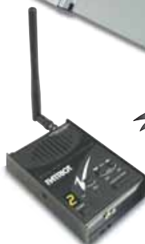
Patriot Base Station