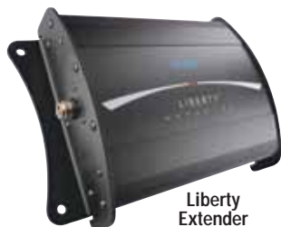
Liberty Extender Repeater